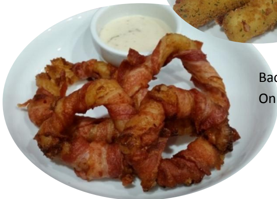
Bacon Wrapped Onion Rings