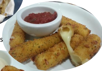
Mozzarella Cheese Sticks