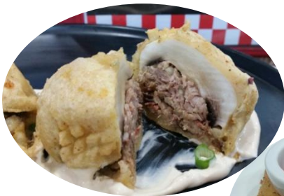
Brisket Stuffed Mushrooms